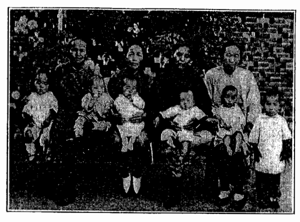
Little babies are cared for by faithful women who are not their mothers

Brother Anglin estimates that a well and water storage tank, with piping facilities to install water in the different buildings will cost about $4,000, and he suggests that if each one of our readers would give only $1.25 toward this well